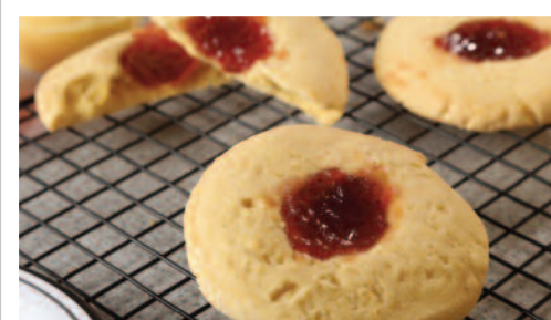
Jam & Custard Biscuit