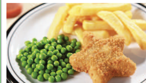
Fish Star (MSC) served with Chips & Peas or Baked Beans

VEGETARIAN VERSIONS OF THE ABOVE MEAL AVAILABLE DAILY