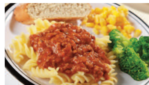
Pasta Bolognese served with Garlic & Herb Bread and Seasonal Vegetables