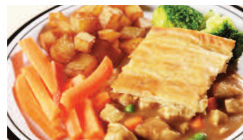
Homemade Chicken Pie served with Diced Crispy Potatoes & Seasonal Vegetables