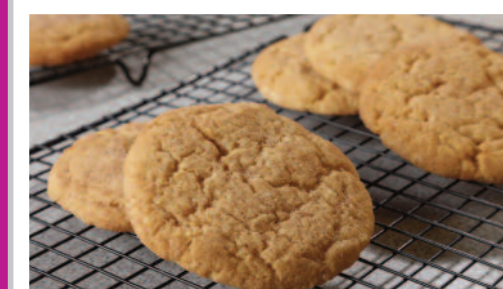
Snicker Doodle Biscuit

AVAILABLE EVERY DAY – UNLIMITED SALAD, FRESHLY BAKED BREAD, FRUIT YOGHURT & FRESH FRUIT PLATTER. FOR ALLERGEN INFORMATION, PLEASE ASK ONE OF OUR CATERING TEAM. ALL THE ABOVE DISHES ARE SUBJECT TO AVAILABILITY.