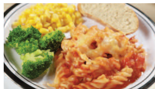
Cheese & Tomato Pasta served with Garlic & Herb Bread and Seasonal Vegetables